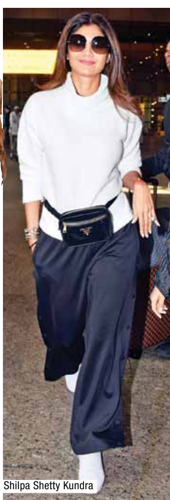
Shilpa Shetty Kundra